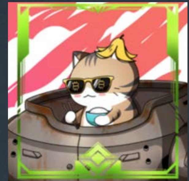
[ UNCOMMON ]