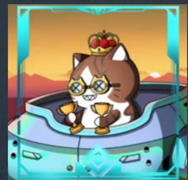
[ RARE ]