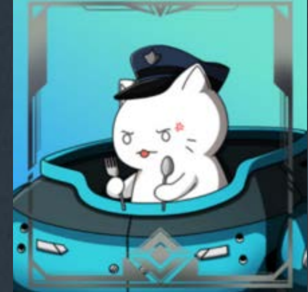
[ COMMON ]