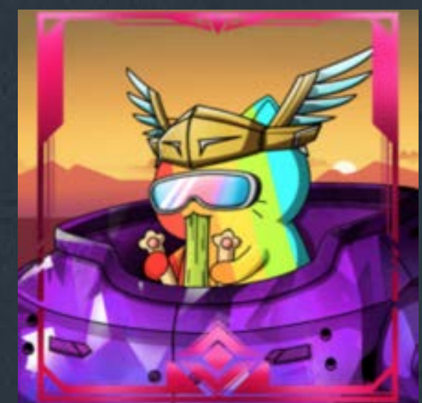
[ ULTRA RARE ]