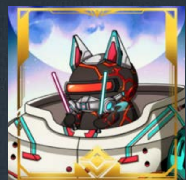
[ LEGENDARY ]